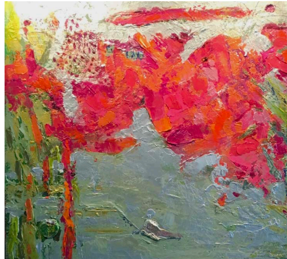
Buganvillea and Willow Giverny: Re-Imagined Series Mixed Media on Canvas