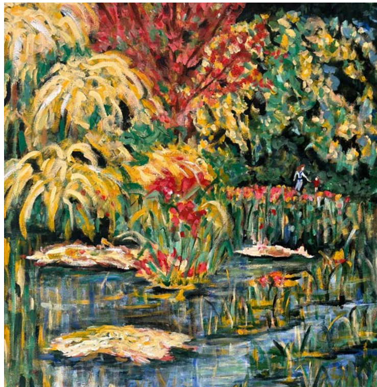
Le Jardin Giverny I Oil on Canvas