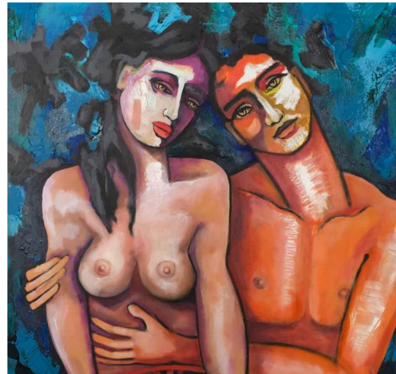
Adam and Eve Mixed Media on Canvas