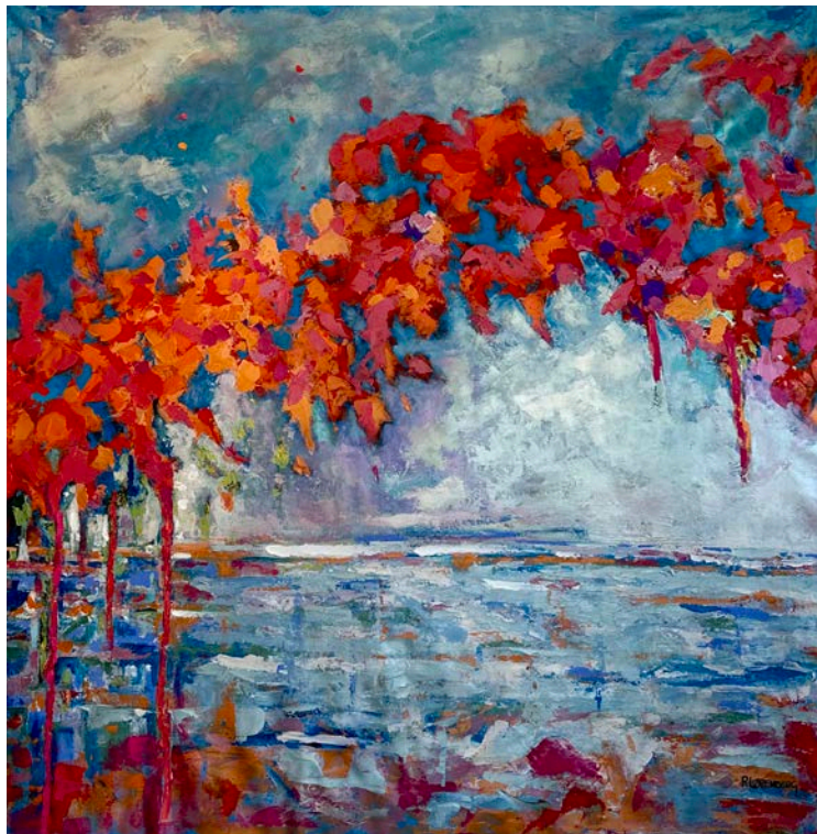
Flores de Buganvilla Mixed Media on Canvas