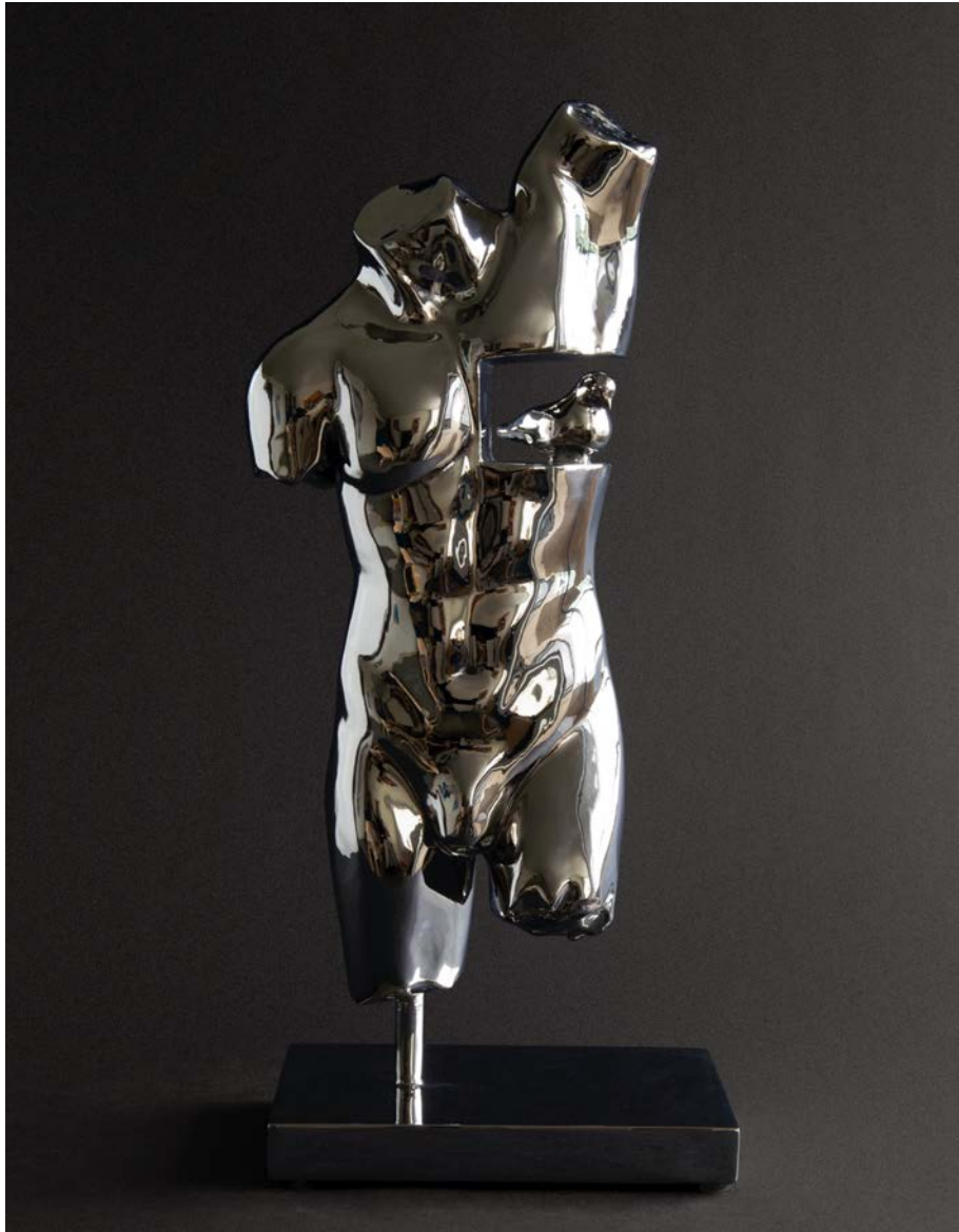
Alex The Magic Process Series Polished Stainless Steel